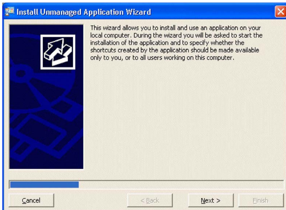
Install Unmanaged Application Wizard

Software installed by the end-user will be available in a special menu "Programs (unmanaged)" in the user's Start menu, but will NOT be visible in the Real Enterprise Manager. When new software is installed, the end-user can choose whether the new software will be available only to him or to all users logging on to that workstation.